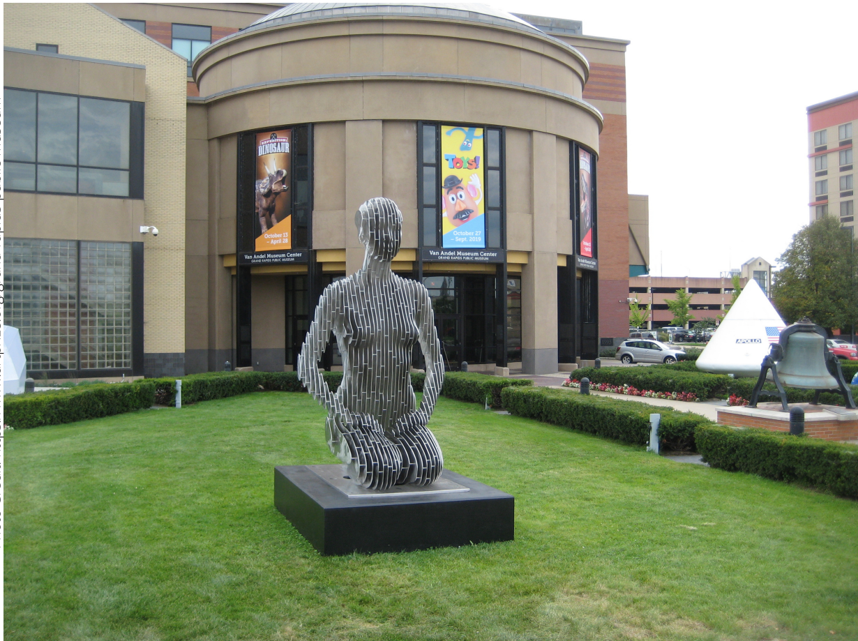
Grand Rapids Public Museum - ArtPrize Venue - An open art contest based in Grand Rapids Michigan, the world's largest Art Competition.